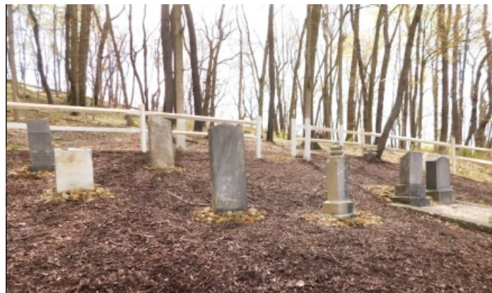
Figure 3: Ahavas Achim Cemetery, April 19, 2021

The land, at this writing, is reportedly owned by “Elrod Cemetery,” though no evidence of the existence of any corporate entity by that name has been found in Allegheny County. It is under the care of the Jewish Cemetery and Burial Association of Greater Pittsburgh (JCBA). 10