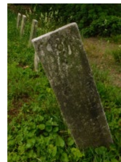
Figure 7: “Slab” stones, Keshet Israel Cemetery, Port Vue

Similar stones can be found in the Keshet Israel Cemetery in Port Vue. Most of the Port Vue “slab” stones are in situ , and arranged in a row as one would expect to see grave markers. On that evidence, we conclude that the numbered stones at Ahavas Achim did, at one time, mark the locations of burials. The slab stones found at Ahavas Achim are inscribed with the