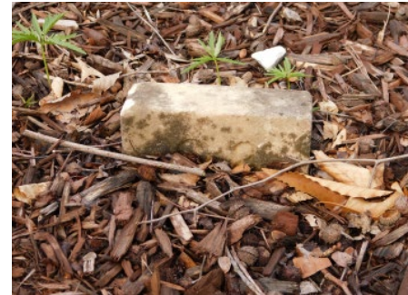
Figure 5: Unknown burial #68.

The two stones, like the one shown in the photo at right, bear only an inscribed number. Only the tops of the digits “6” and “8” can be seen etched into this small stone without digging an inch or so into the soil. The two taller stones are inscribed with the numbers 152 and 158. The numbers are etched into the surface of the stone facing away from the road, which is the orientation of the face inscriptions on the known grave markers.