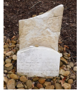
Figure 9: The 8 th stone, as yet unidentified

In addition to the numbered stones discussed above, there is one more unidentified grave at Ahavas Achim: a broken stone that presumably stands today in its original location, but which has defied all attempts to read its inscription. While Hebrew text can be seen on the face of the stone, it is badly worn, and the line of text that is expected to contain the name is below ground level. Sadly, the identity of this individual will not be known until new information comes to light.