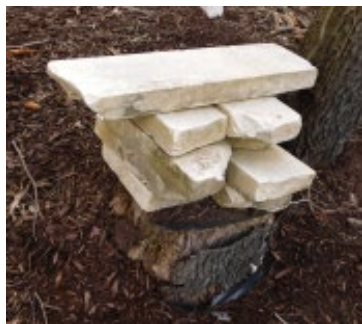
Figure 6: Numbered stones stacked in the corner of the Ahavas Achim cemetery

In the corner of the cemetery is a stack of stones, the significance of which had not been immediately recognized. It now became apparent that these stones were, in fact, identical to the two taller stones. It was further recognized that the small stone pictured above was actually the top of one of those numbered stones, the full length of which is almost two feet. It turns out that most of the stones in the stack are numbered, as well. The ones that are not numbered appear to be the lower fragments of the numbered stones.