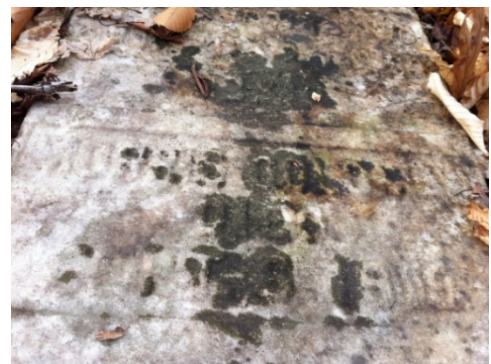
Figure 1: Gravestone of Moses “Morris” Goldman, found intact, fallen, lying face-up. December, 2012.

Photos were taken, and a record of the legible Anglo text from the stones was submitted to the Allegheny County Archives web site, a part of the USGenWeb Archives, in order to preserve the knowledge that had been acquired and to make it available to future researchers.