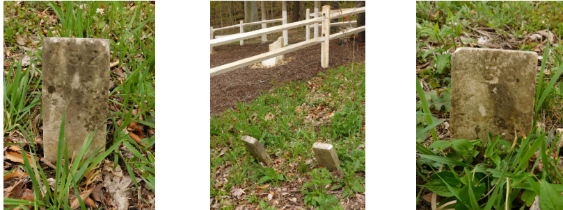
Figure 8: Unknown burials #152 (left) and #158 (right)

Although the in situ stones provide only three data points, the order of the numbers suggests a chronological layout, with the older (lower-numbered) burials near the northern boundary. One is left with impression that these burials were done in haste, with no time allotted for a full inscription.